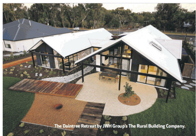
The Daintree Retreat by JWH Group's The Rural Building Company.