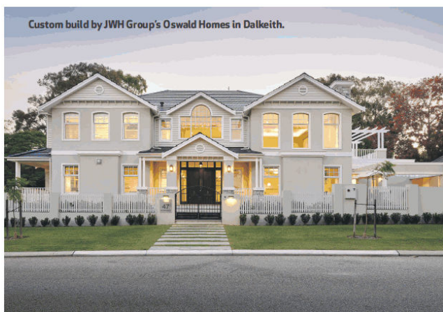
Custom build by JWH Group's Oswald Homes in Dalkeith.