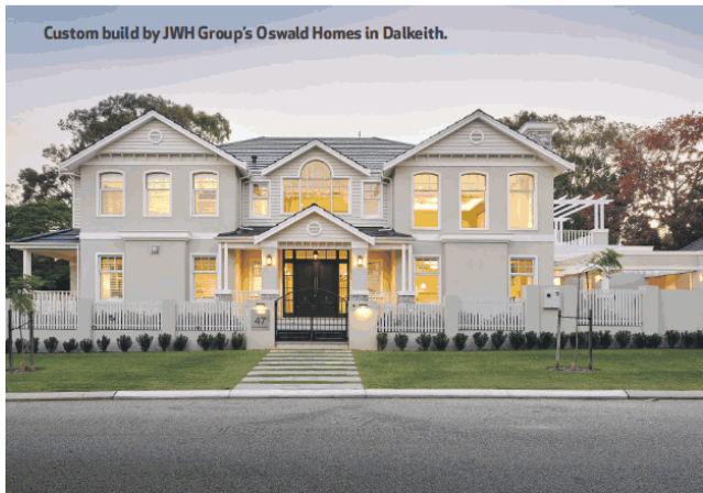
Custom build by JWH Group's Oswald Homes in Dalkeith.