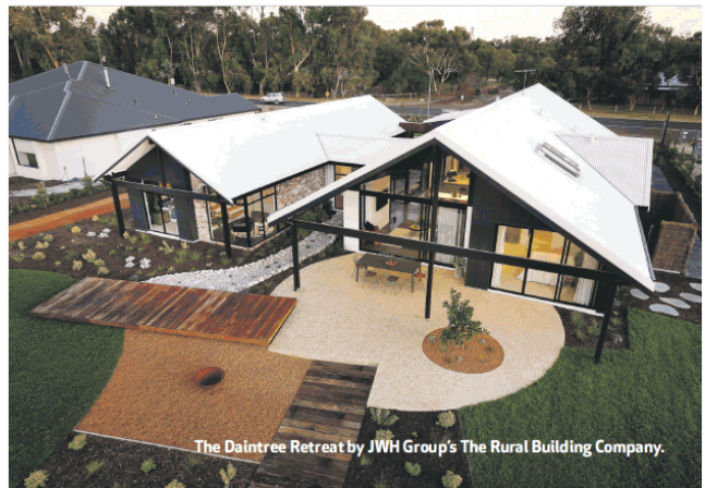
The Daintree Retreat by JWH Group's The Rural Building Company.